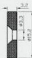
MN600 for BR-1011DMWG