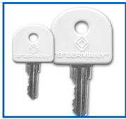
Master Key w/logo