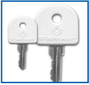
Master Key w/logo