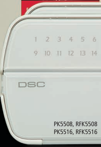
PK5508, RFK5508 PK5516, RFK5516