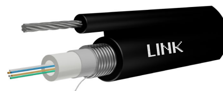
Outdoor, Stranded Drop Wire, Armored UFCX5XXDSA