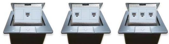
UL-2011A UL-2012A UL-2013A

Body : Galvanized Steel Gasket : IP44 Square Box : Stainless 100 x 100 x 62.1 mm with 1/2" & 3/4" Knockout (included) Compatibility : RJ11 Modular Jack