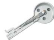
UL-8803 TOOL for DROP WIRE MODULE only