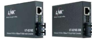
Enhance Series : 10/100 Converter