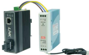
UT-0216MI , UT-0216MI-SM20 : 10 / 100 MINI - Industrial Converter w/ DC Power Supply