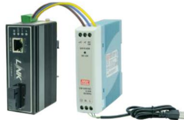
UT - 0215MI - TS20 : 10 / 100 SINGLE F.O. MINI Industrial Converter UT - 0215MI - RS20 : 10 / 100 SINGLE F.O. MINI Industrial Converter