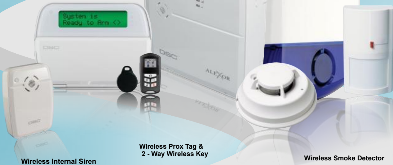
Wireless Internal Siren